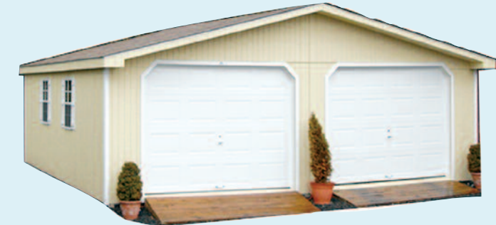
2-CAR 1-STORY GARAGE