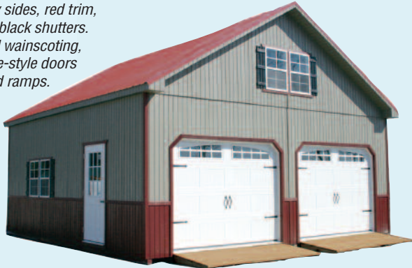
2-CAR 2-STORY GARAGE

24x24 clay sides, red trim, red roof, black shutters. Optional wainscoting, carriage-style doors and ramps.