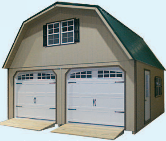
2-CAR 2-STORY GARAGE

20x24 with beige sides, chestnut trim, green roof. Optional carriage-style doors and ramps. →