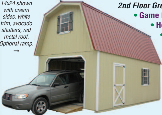
1-CAR 2-STORY GARAGE

14x24 shown with cream sides, white trim, avocado shutters, red metal roof. Optional ramp.